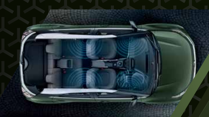
8-SPEAKER SYSTEM BY HARMAN™

Feel your heart thump to the beats of supremacy.